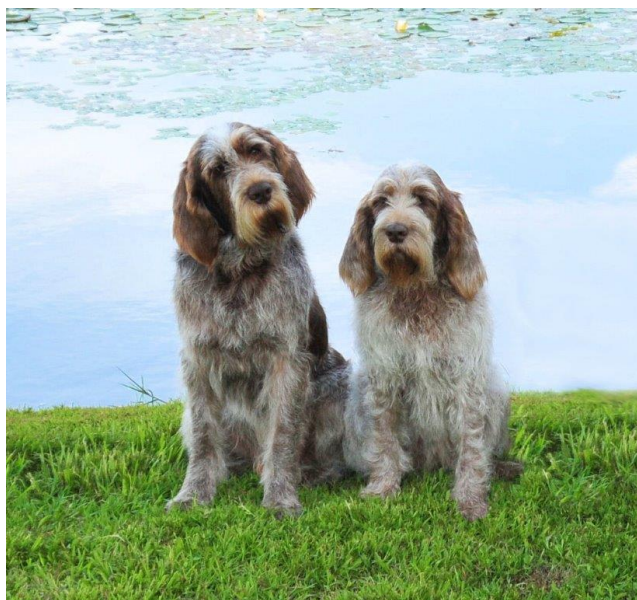
CH Drago Castellano of Trollbo MH CD RE THDD JHR CGCA TKP (TDIGOLD, TWT), 2013 AKC ACE, and Siena Castellana DiMorghengo MH CDX RAE THDD JHR TKP CGCA (TDIG TWT) continue to excel at their therapy work.