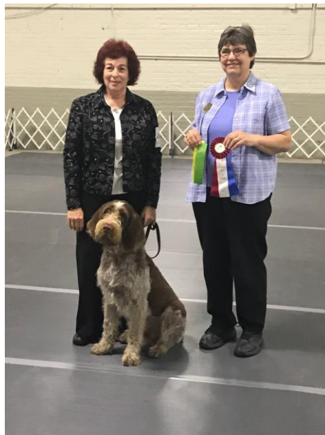
Dry Grass Veloce Diavolo Castellano del Lago CGCA TKI RN recently earned his RN on July 4, 2018, and went on to earn a 3 point major in conformation with his BOB win.